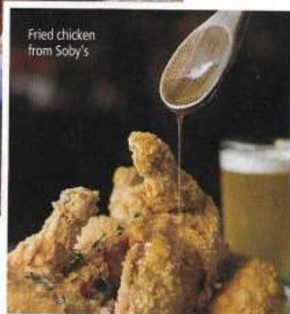
Fried chicken from Soby's

downtown Greenville, he leaves everyone in his wake buoyant. Even after 20 years of owning and operating restaurants, his energy and passion are infectious, making him a rare find in an industry with high burnout rates and higher stress levels.